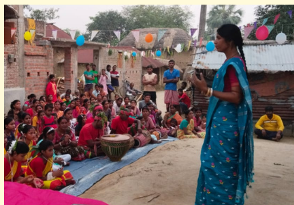
Community cultural events