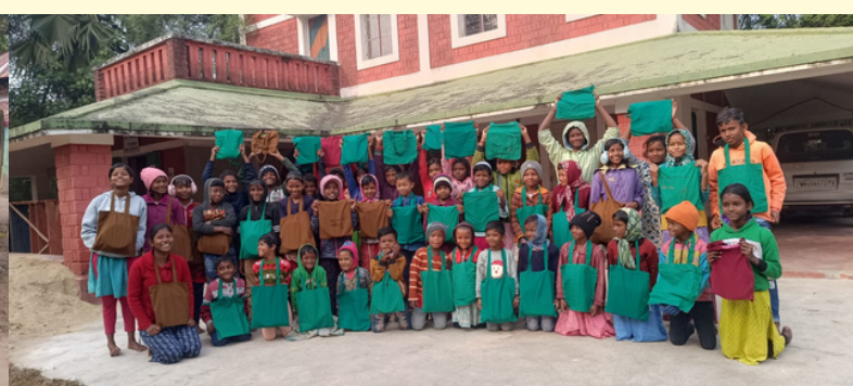
Students at the main centre displaying bags that they made to carry their books to school and to Suchana.