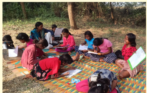
Children participating in a story-writing competition

A story writing competition was held with 84 students from 32 villages participating. These students, from Suchana’s library and ITE programs, created original stories inspired by the books they had read throughout the year. 25 stories were selected to be published in a student magazine, and winners were awarded prizes at the Annual Function in February 2025.