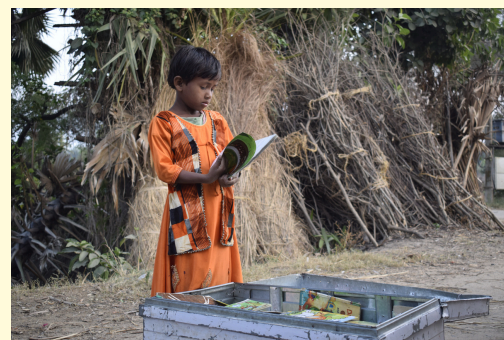
A mobile library student reading a book in Santali, her mother tongue