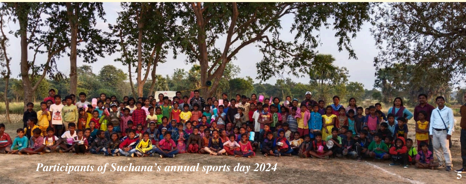
Participants of Suchana's annual sports day 2024