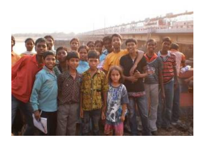
At the Damodar Dam