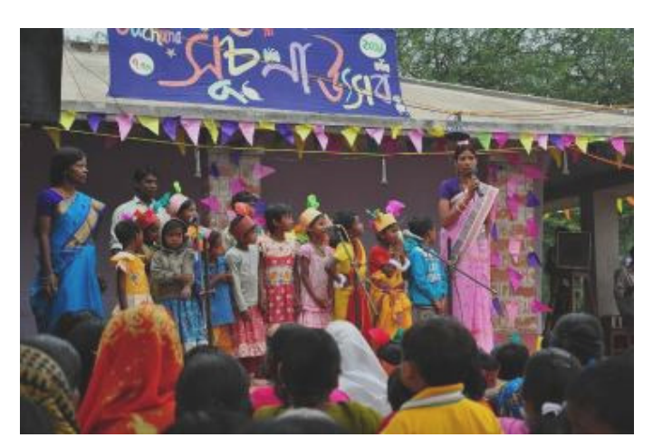
Pre-schoolers performing at the show

Suchana's biggest yearly event the Annual Function was held on 20<sup>th</sup> February 2011, it included 15 acts that the children had learned and practiced since the beginning of January.