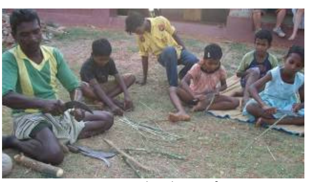
Learning bamboo craft

Current activities, run by Suchana teachers as well as local people, include: bamboo basket making, science games, creative writing in Kora, Santali songs, pottery wheel work, origami, creative writing in Santali, making embroidered mats, basket making with straw and recycled plastic, Bangla dance, puppet making, making hand fans with leaves, Bangla drama, vegetable gardening, working with wool, and broom making.