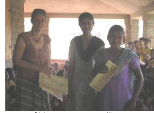
Giving out computer certificates

By April 2011 the course had taught 32 Suchana children and 20 young adults, from different villages in basic computer skills and application. 10 more children and 10 more adults are now attending the current course.