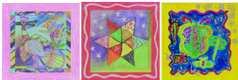
Bird of Paradise