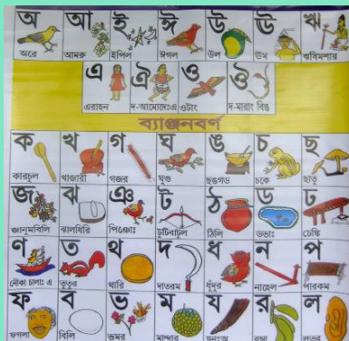
Kora alphabet chart