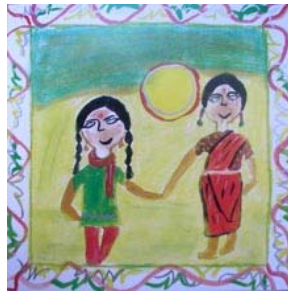
Mother and Daughter