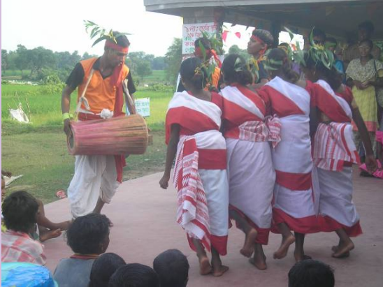
Kora dance at the Mela

On October 14 th , we began a twice weekly 'tuitions' programme in Maths, Science, and English for middle school children – these are the subjects many routinely fail. Often, this means they have to repeat the year, and most ultimately drop out. We hope our tuitions can help break this pattern.